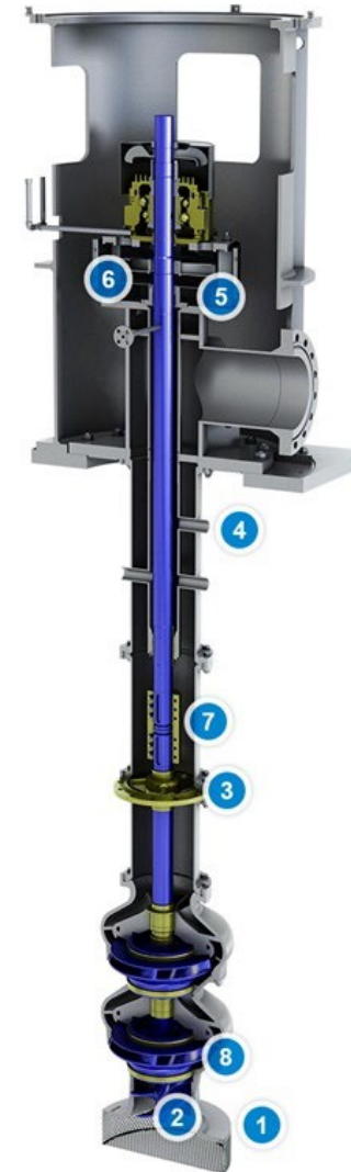
Sulzer VEV Pump design cross section